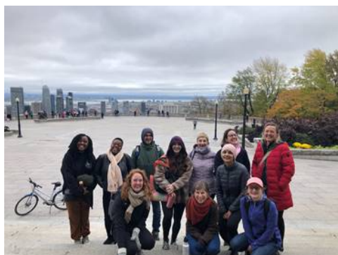
Wellness Day 2021 at the Mont-Royal